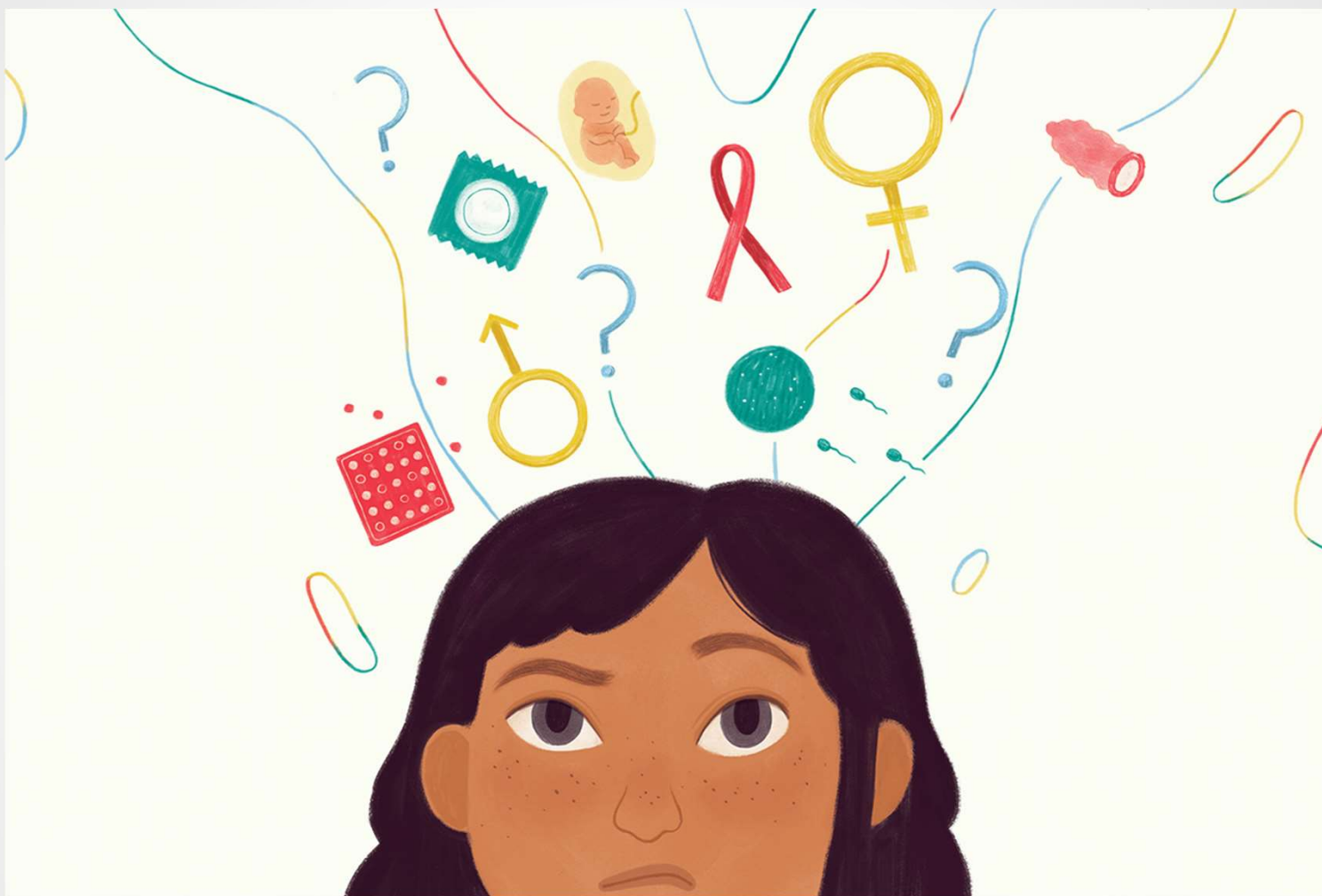
Ilustração: Marcella Tamayo, retirada do sítio eletrônico https://novaescola.org.br/conteudo/18073/do-que-estamos-falando-quando-nos-referimos-a-educacao-sexual