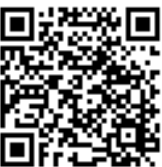
SENADOR MARCOS DO VAL Podemos/ES

Sendo assim, solicito a Vossa Excelência autorização para representar o Senado Federal em missão oficial no exterior, em viagem aos Estados Unidos da América, com ônus para o Senado Federal (diárias e passagens).