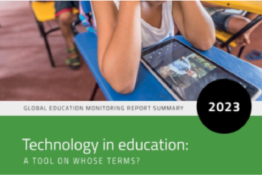
Global launch of the 2023 GEM Report on technology in education in Montevideo (Day 1)