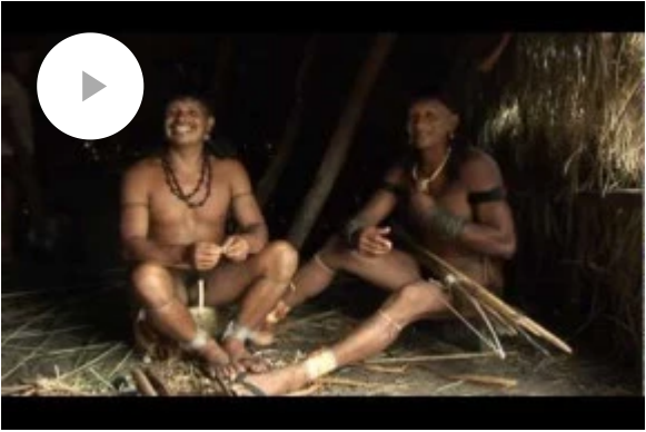
Yaokwa, the Enawene Nawe people's ritual for the maintenance of social and cosmic order