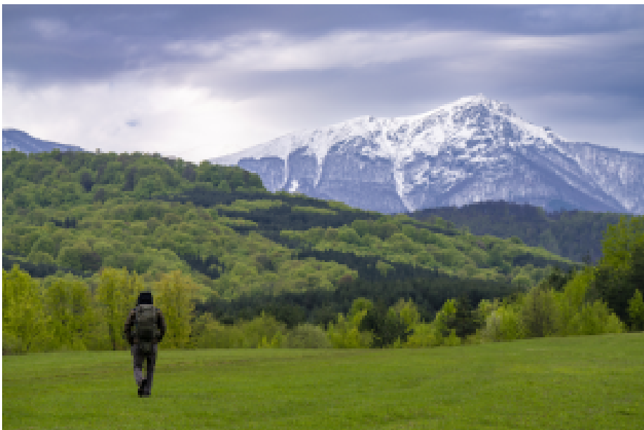
UNESCO announces 13 awards for young researchers working in biosphere reserves