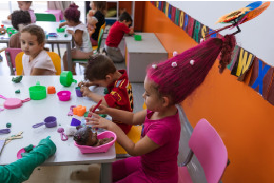
In Brazil, providing a safe space for children to learn and flourish