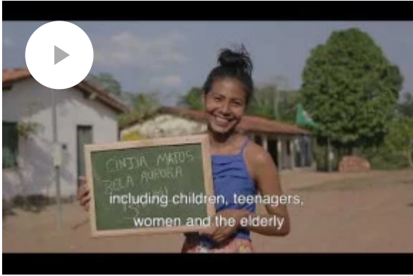
UNESCO GREEN CITIZENS | Brazil : Cultivating the Cupuaçu to protect biodiversity