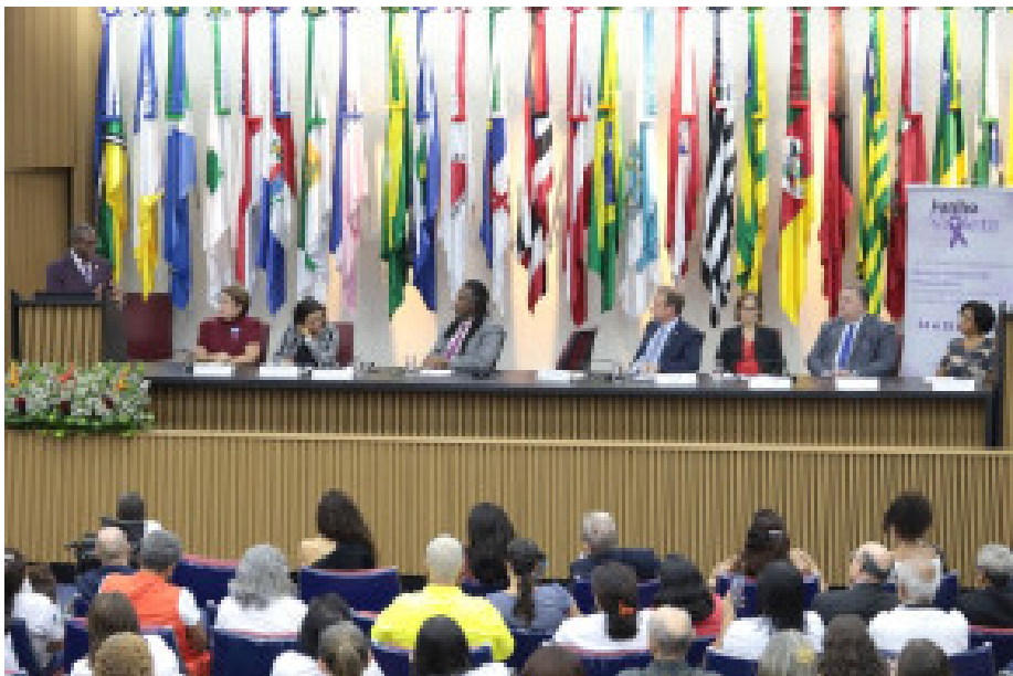
UNESCO participates in a Seminar alluding to the World Elder Abuse Awareness Day in Brasília