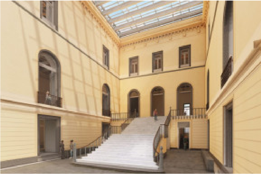
IPHAN authorizes a new installation in the National Museum/UFRJ project