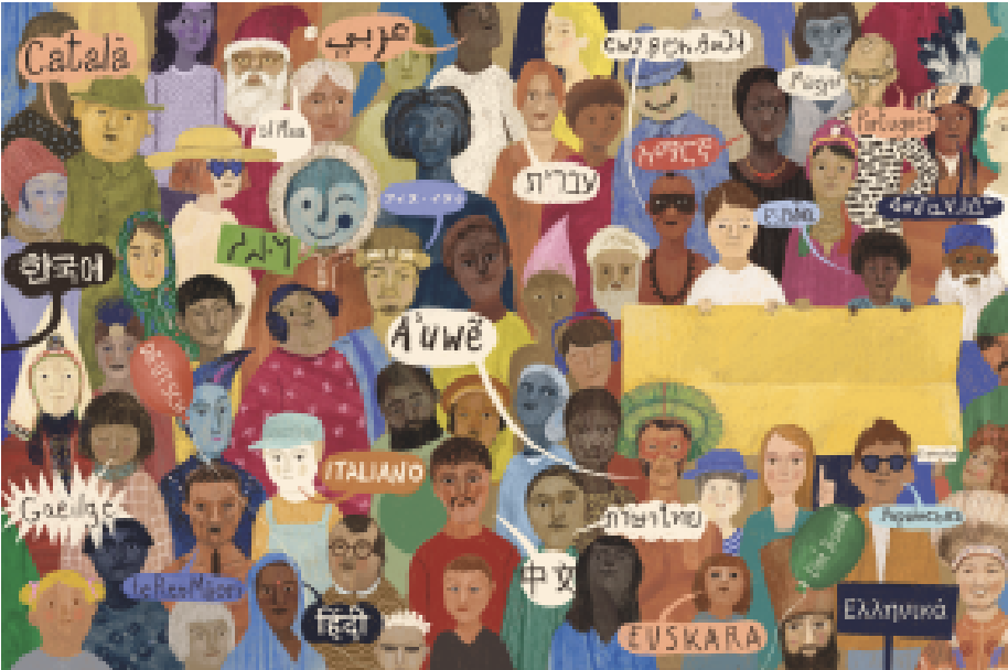
What makes us human?